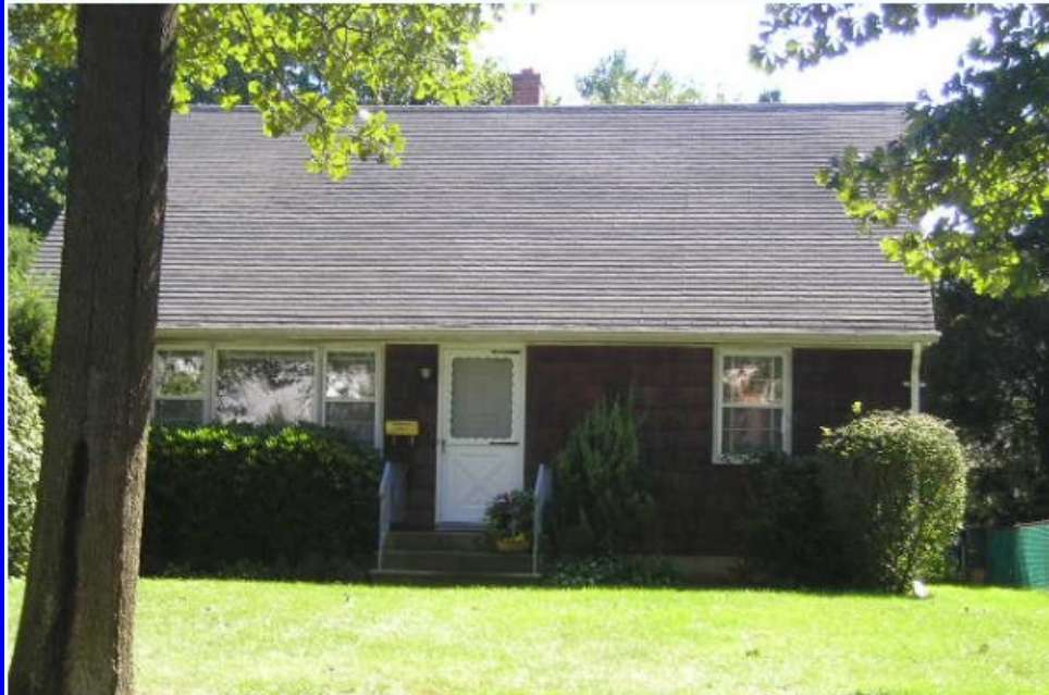
09/20/04 15:25:24 #2